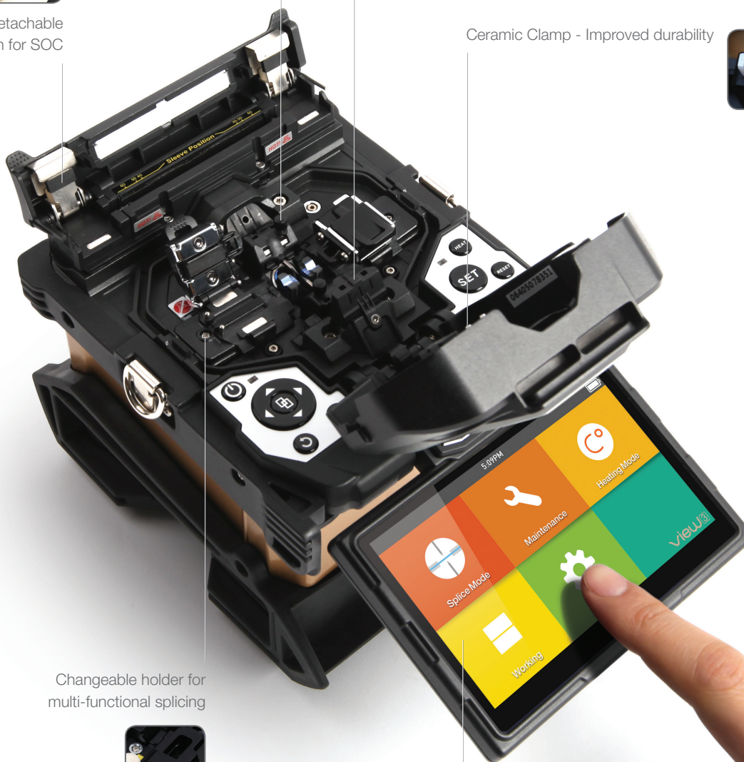
Changeable holder for multi-functional splicing