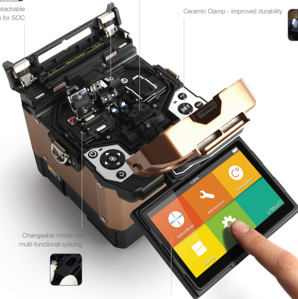
Changeable holder for multi-functional splicing